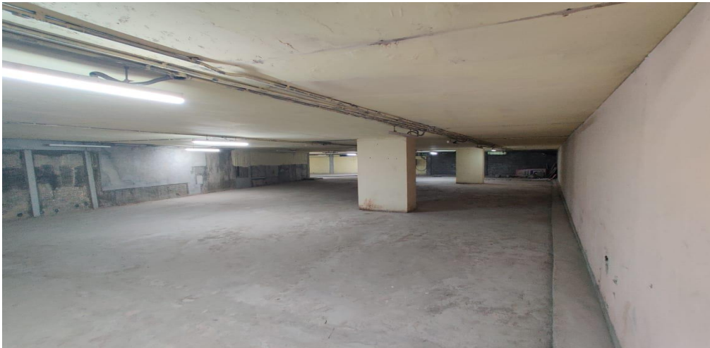
Commercial space CTCP-02