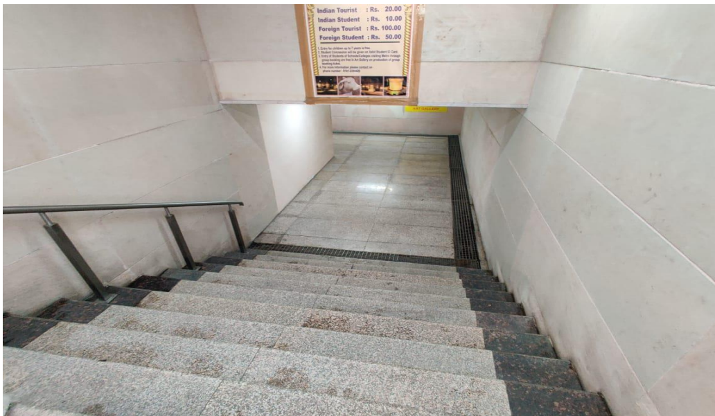
Entry from Gate No. 2