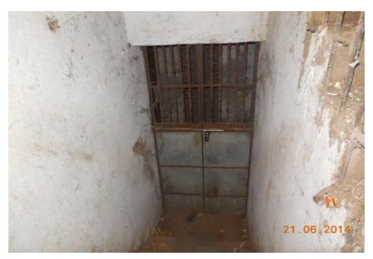
<u>Photo No. 93</u>