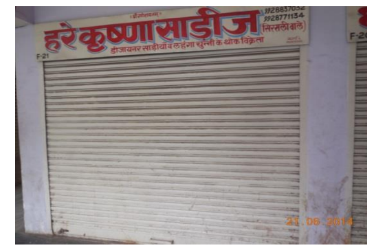
<u>Photo No. 54</u>