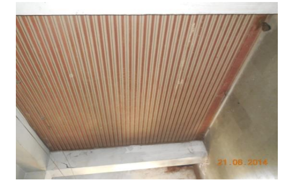
<u>Photo No. 99</u>