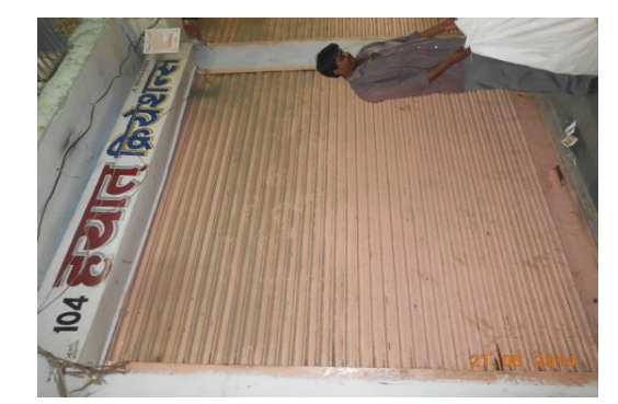
<u>Photo No. 81</u>