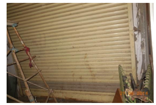
<u>Photo No. 45</u>