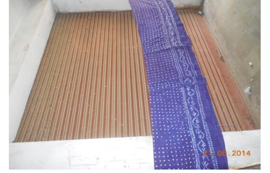
<u>Photo No. 98</u>