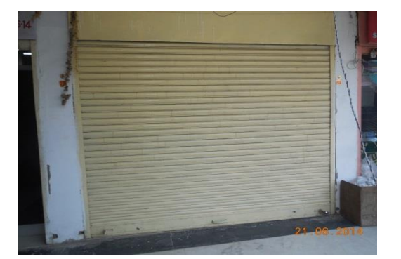
<u>Photo No. 62</u>