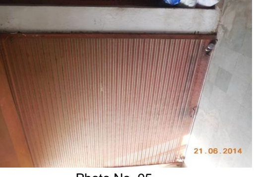
<u>Photo No. 95</u>